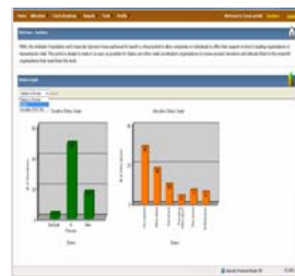
Executive dashboard reporting