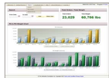
Order History Graphs