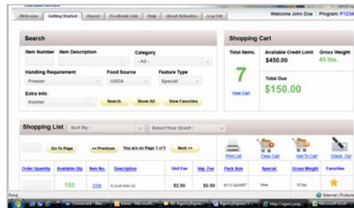
Order Options Screen